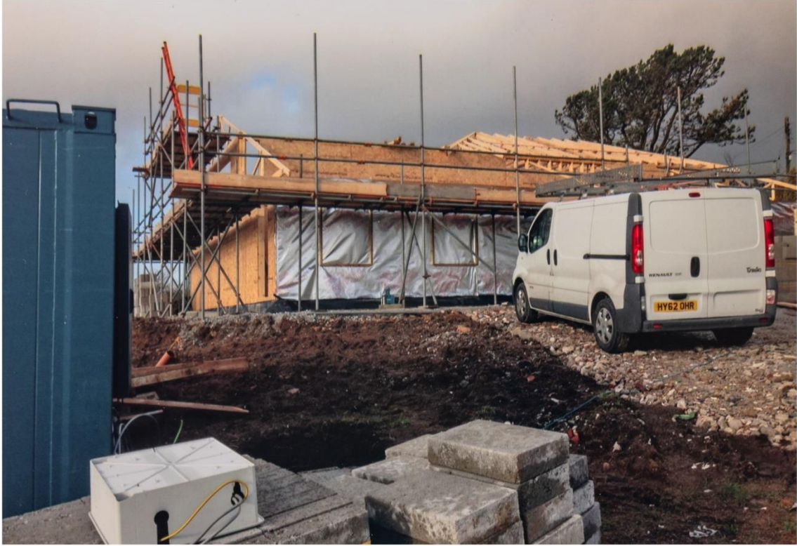
The new chapel being built December 2018